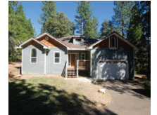
Pioneer 26878 Crawley Ln. $229,900 #1200839