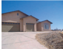
Ione 4340 Cheyenne $220,000 #1200860