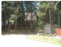
Pioneer 16845 Alpine Dr. $64,900 #111560AA