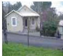
Amador City 14486 Church St $129,900 #111311A