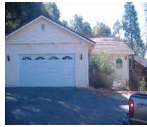
Jackson 19840 Clinton Rd $274,000 #1200692