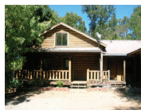
Jackson 630 Sierra Street $128,000 #1200732