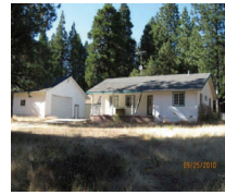
Volcano 18765 Gold Creek $104,900 #1200976