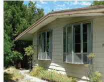
Pine Grove 14074 Irishtown Rd #15 $45,000 #1200164