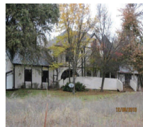
Volcano 18590 Charleston $281,000 #1201007