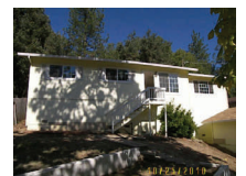
Pine Grove 19101 Ridge Rd $95,650 #1200834