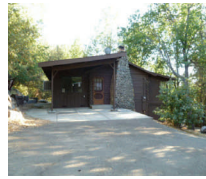
River Pines 22918 West Ave. $79,000 #1200729