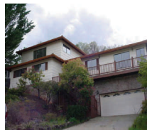
Sutter Creek 115 David Dr. $249,900 #1200083