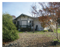
Ione 4075 Teton Ct. $112,900 #1200936