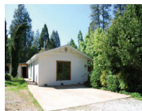
Pine Grove 13165 Tabeaud $168,000 #1200616