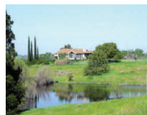
Ione 2800 Curran $238,368 #1201059