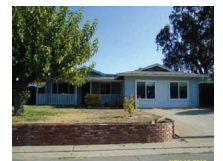
Ione 530 Nuner Drive $160,000 #1200974