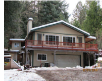
Pioneer 16720 McKenzie $129,900 #1201025