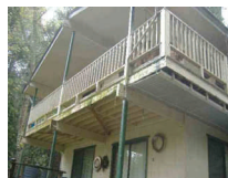
Sutter Creek 16762 Shake Ridge $89,000 #111777A