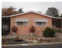
Jackson 38 Evergreen $35,000 #1200971