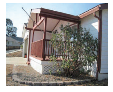
Plymouth 9281 Estey $133,600 #1200896