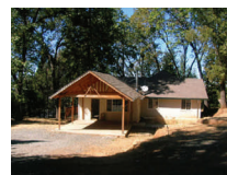
Volcano 22255 Allan Rd $134,900 #1200917