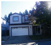
Jackson 200 Terrace View $171,000 #1200913