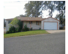
Sutter Creek 325 Patricia Ln. $154,900 #1200926