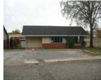
Jackson 10583 Mariposa $144,900 #1201013