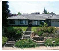
Sutter Creek 320 N. View Ct. $252,900 #1200088