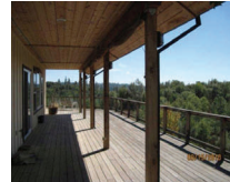
Sutter Creek 16950 Sunshine $389,000 #1200770