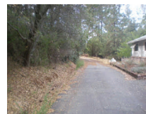
Jackson 10747 Ranchette $164,900 #1201056