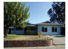
Ione 530 Nuner Drive $160,000