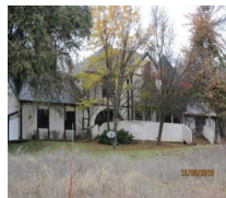
Volcano 18590 Charleston $281,000 #1201007