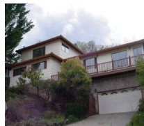
Sutter Creek 115 David Dr. $249,900 #1200083