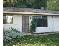
Sutter Creek 140 Greenstone Ter $304,900 #11000009-ML