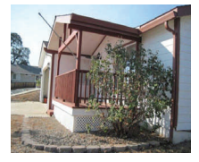
Plymouth 9281 Estey $133,600 #1200896