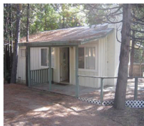
Pioneer 26742 Columbia Dr $69,900 #10098469-ML