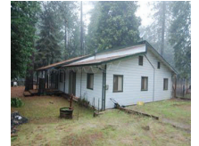
Pioneer 26281 Oxbow Rd $110,000 #10098644-ML