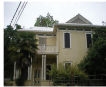
Mokelumne Hill 8500 Lafayette $114,900 #101900