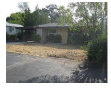
Angels Camp 280 Clifton $126,500 #102094