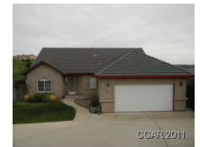
Valley Springs 1089 Mockingbird Hill $180,900 #110638