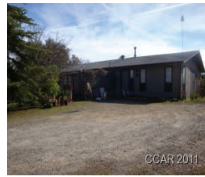
Mountain Ranch 5480 Old Emigrant Trl E $164,900 #110439