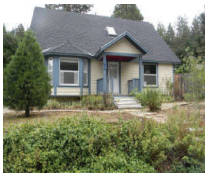
Arnold 1616 Blagen $159,900 #101978