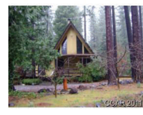
Avery 311 Blue Bird $139,900 #110658