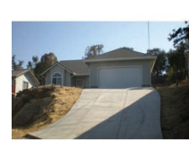
Copperopolis 4678 Bayview $129,000 #091580