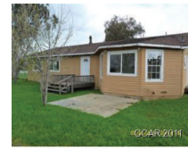
Valley Springs 9799 Scenic Val- ley Rd $153,900 #110664