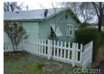
Angels Camp 690 Kirby $70,000 #110707