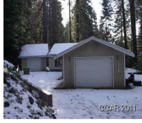
Arnold 1330 Shady Cir. $124,900 #110212