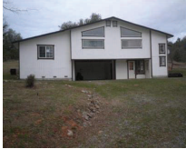
Mountain Ranch 6851 Quartz Mine $199,900 #11015660-ML