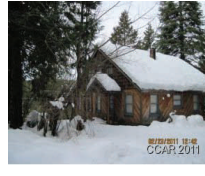
Arnold 1775 4th $149,900 #110605