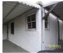
San Andreas 262 High School St. $49,900 #110534