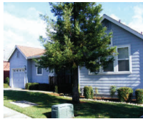
Angels Camp 837 Selkirk Ranch $215,000 #110035