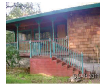
Mokelumne Hill 11455 Hwy. 26 $145,900 #110400