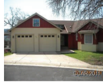
Angels Camp 411 Perlina Terrace $471,240 #110691