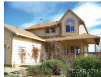
Mountain Ranch 9768 Wendell Rd. $270,900 #110461