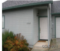
Angels Camp 1265 Annalee $74,900 #110486