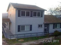
Copperopolis 3710 Arrowhead $159,900 #110653