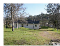
Copperopolis 4991 Yuma $109,900 #110329