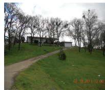
Valley Springs 3438 Huckleberry Ln. $86,500 #11015471-ML