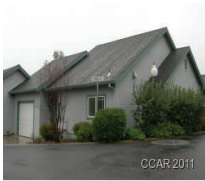
Angels Camp 1275 Annalee $47,900 #110688