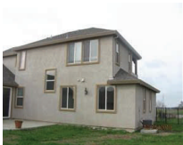
Wallace 1 Cormorant $205,900 #110051