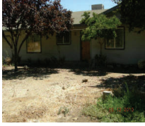
Valley Springs 2919 Hwy. 26 $62,700 #110010