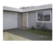
Valley Springs 2809 Heinemann $79,900 #110499