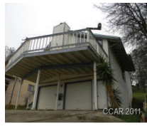
Copperopolis 4988 Pueblo $110,900 #110359