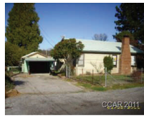
Angels Camp 340 Bennett $86,900 #110306