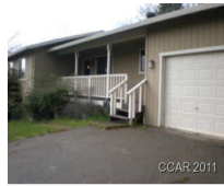
Valley Springs 3286 Crowell $87,900 #110718