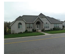
Copperopolis 1346 Knolls Drive $299,900 #11024104-ML