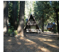
Camp Connell 218 Creekside $124,900 #102261