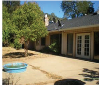
San Andreas 2901 Willow Creek Rd. $244,900 #101967