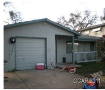
Valley Springs 79 California $79,500 #110493