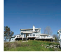
Vallecito 7557 Airola $539,900 #110328