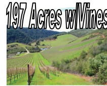
Murphys 3200 San Domingo $2,800,000 #090482