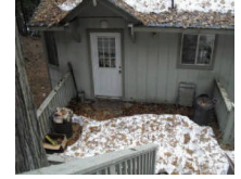
Twain Harte 23548 Ontario $179,000 #102311