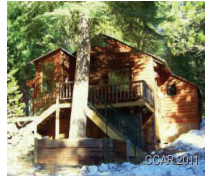
Camp Connell 44 Campbell Ln $146,000 #110208