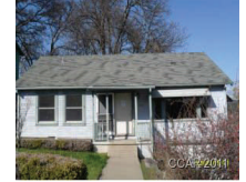
San Andreas 455 Alfreda $85,500 #110547