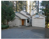
Arnold 145 Mill Creek $117,500 #102152