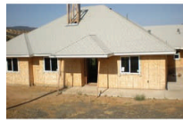
Copperopolis 2470 Choctaw $120,000 #091665