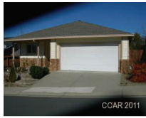
Angels Camp 977 Country Lane $177,600 #110531