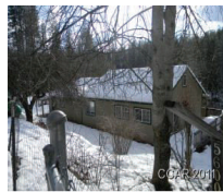
Avery 5600 Segale Rd. $155,900 #110690