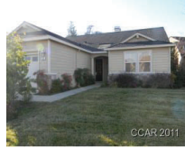
Copperopolis 265 Mitchell Lake $240,900 #110303