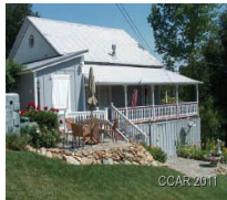
Angels Camp 1335 Love Street $125,500 #110453