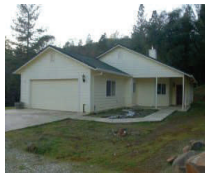
Mountain Ranch 4502 Railroad Flat $162,900 #110070