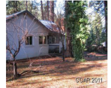
Hathaway Pines 105 Horseshoe $119,500 #110234