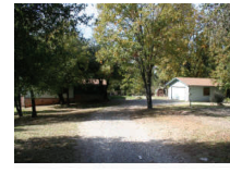
Railroad Flat 1431 David $124,900 #102151