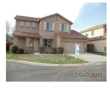
Valley Springs 180 Gold Dust $158,000 #110624