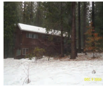
Arnold 1813 Fairway Dr. $133,000 #102264