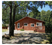
Mountain Ranch 7580 Doster Road $129,500 #110052