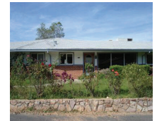
Angels Camp 997 Mark Twain $215,900 #10063981-ML