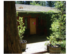
Avery 503 Sheep Ranch $189,900 #110032