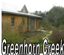
Angels Camp 273 Smith Flat $609,900 #110717