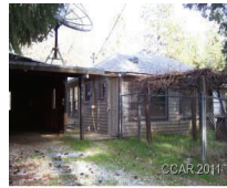
Wilseyville 4384 Railroad Flat Rd. $55,000 #110424