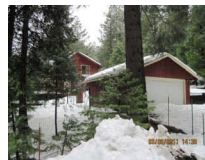
Pioneer 27485 E. Inspira- tion Dr. $127,900 #AM1201460