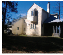
Volcano 19151 Ponderosa $129,900 #AM1201160