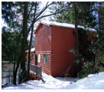
Pioneer 24192 Gold Cir. $85,000 #AM1201463