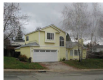
Jackson 150 Placer Drive $204,900 #AM1201275