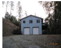
Sutter Creek 14550 Manzanita $244,900 #AM1201127