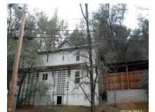
Fiddletown 14655 Fiddletown Rd. $310,000 #AM1201346