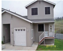
Lake Camanche 4274 Lakeview Dr. B $125,000 #AM1201476