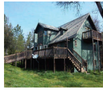
Fiddletown 4301 Eden Lane $223,000 #AM1201583