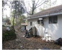
River Pines 22976 Rock Ln. $59,000 #AM1201280