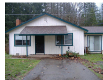
River Pines 15045 Shenandoah $81,750 #AM1201578