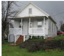
Sutter Creek 420 Sutter Hill $174,900 #AM1201324