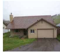
Ione 4234 Lakeview Dr $129,000 #AM1201498