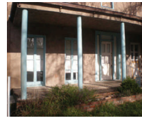
Ione 17 E. Jackson $79,900 #1201158