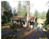
Pioneer 22775 Red Corral $124,900 #1201187