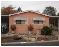
Jackson 38 Evergreen $18,000 #1200971