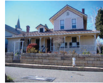
Jackson 215 Court $209,900 #AM1201587