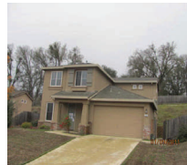
Jackson 975 Ponderosa St. $255,000 #AM1201246