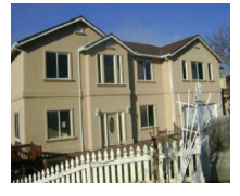
Jackson 123 Gordon Pl $209,000 #AM1201271