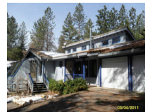
Pioneer 23841 Carson Dr $140,000 #AM1201411