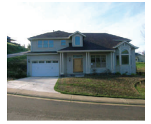
Sutter Creek 285 Golden Hills $352,300 #1201170