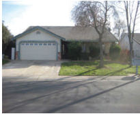
Ione 330 Cottonwood $139,000 #AM1201282