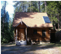
Pioneer 26701 Four Wheel Dr. Ct. $84,500 #AM1201591