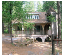
Pioneer 26145 Buckhorn $82,390 #AM1201556