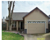
Ione 310 Birchwood Ct. $159,900 #11023260-ML