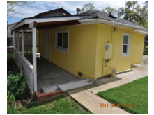
Ione 399 Raymond $94,900 #AM1201574